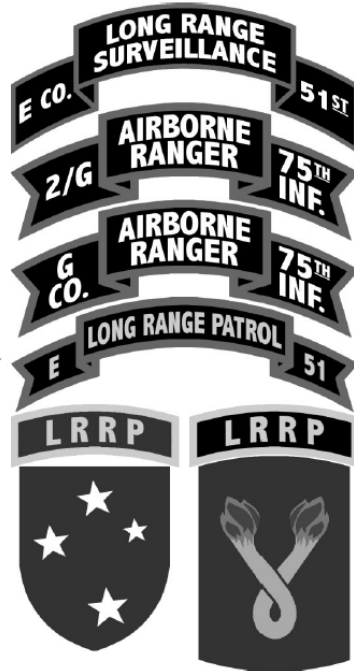
The real heroes of the Vietnam War

Our hotel was just a short walk from "Old Sacramento" and there were plenty of nice places to visit. For those who like trains or simply enjoy museums, the Railroad Museum was amazing and a great educational treat blending our history and our ability to travel. Sacramento has a very nice Vietnam Memo-