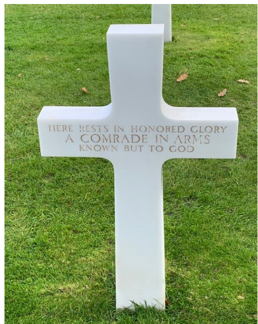
Just one of over 1600 grave markers for unknown soldiers

We all have “bucket lists” things that we would like to experience in our lives. One of mine has always been to go to Normandy to see Point Du Hoc, Omaha Beach and the American cemetery. Thanks to my bride, we made this happen in October. Seeing these places was amazing. Our connection to the WWII Rangers instills a sense of pride that will continue to endure. Of the nearly 10,000 graves in the cemetery, just over 1600 were graves of those who were never identified. The grave markers of the unidentified were the ones that brought my emotions to the surface. If you are reading this, count your blessings.