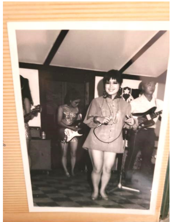
After 4 Millers, these gals were looking really exceptional!